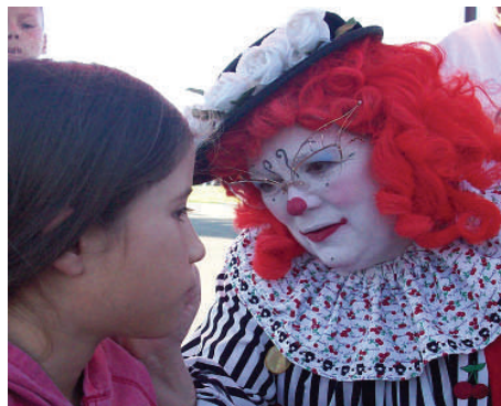
There was a lot of clowning around at last year's inaugural Wellness Festival!

This year, the Festival's sports-a-thons will be held at individual school sites the week before the festival. Details will be forthcoming at each school.